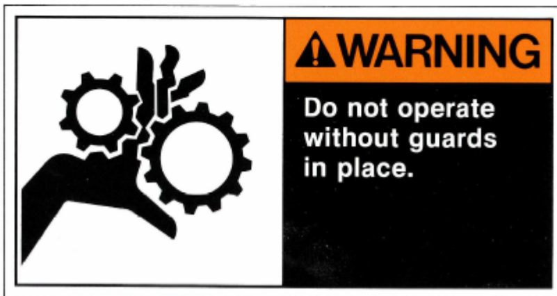
Examples of Product Safety Labels meeting ANSI Z535