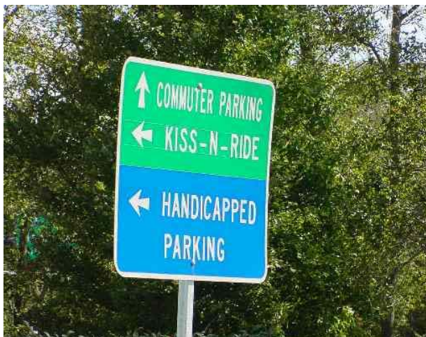
Figure 3-2: Park-and-Ride Guide Sign

Based on the direction provided at the meeting, a preliminary sign design can proceed and should be prepared using the latest design files for the roadways to be signed.