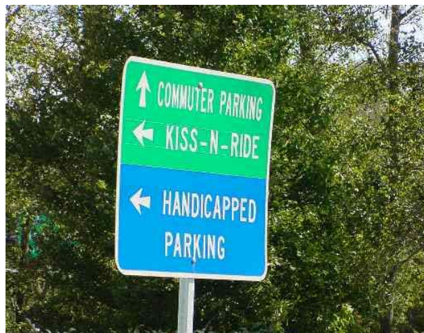
Figure 3-2: Park-and-Ride Guide Sign

Based on the direction provided at the meeting, a preliminary sign design can proceed and should be prepared using the latest design files for the roadways to be signed.