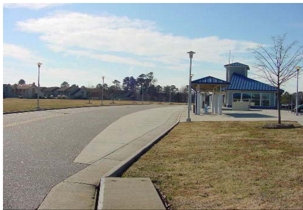
Figure 3-5: Bus Loading and Unloading Area