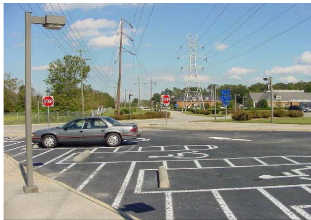
Figure 3-4: Handicapped Marking