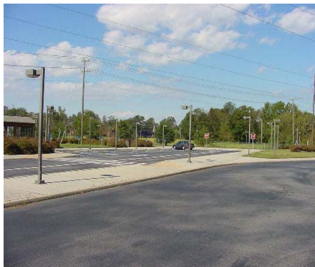
Figure 3-8: Lighting in the Kiss-N-Ride Area

Small Park-and-Ride facilities may be lighted using equipment provided by a local power company. In this case, the VDOT lighting designer may be required to specify only the number and location of lighting standards. The power company, working with the VDOT contractor, will provide the lighting poles, luminaires and supporting electrical equipment. The VDOT Local Assistance Division, Urban Division Manual has a section on Roadway Lighting that fully describes the procedures related to this work.