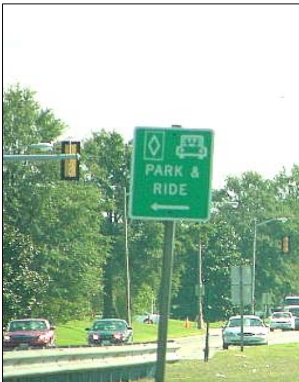
Figure 3-1: Park-and-Ride Advance Sign