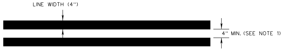
PARALLEL SOLID LINE SPACING (NO PASSING ZONE)