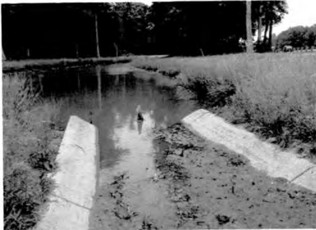
Major "Ponding" due to blockage of outlet