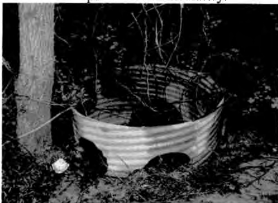
Riser chamber w/excessive amount of sediment