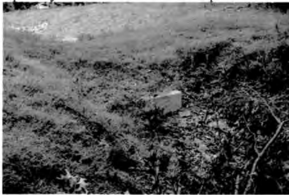
Properly vegetated downstream embankment w/minor erosion