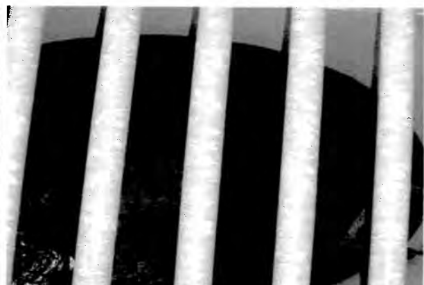
Riser chamber clear of sediment & trash