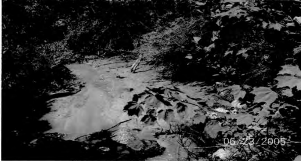
Sediment build-up in inlet due to conveyance channel instability