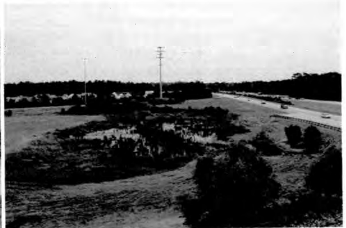
Random "Ponding" within basin