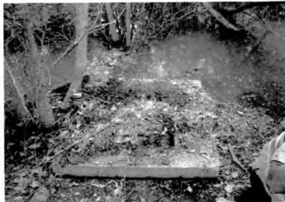
Non functional overflow spillway