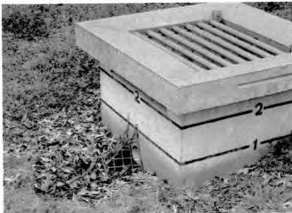
Functional trash rack