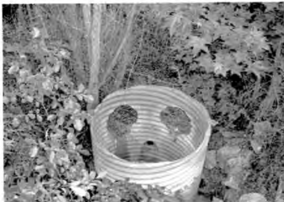
Functional & clear overflow spillway