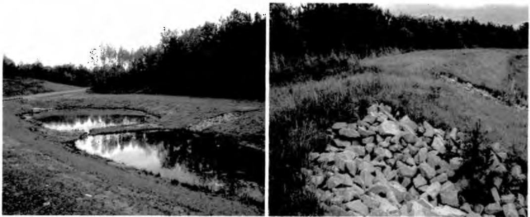
Good access to Basins as well as all the way around Basins for maintenance