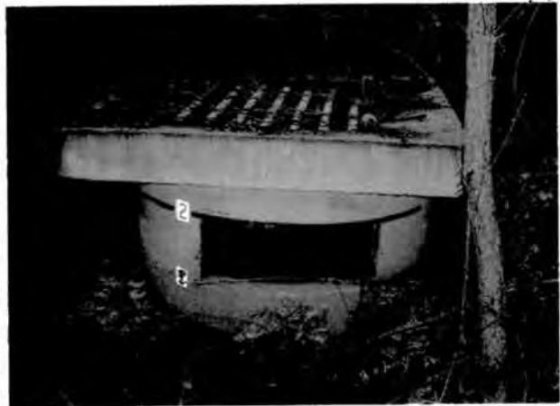
Clear low flow orifice w/ functional trashrack Low flow orifice blocked by trashrack