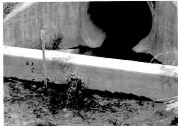
Trash Rack blocked by silt/mud and plastic