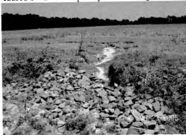
Erosion in watershed upstream of Basin inlet