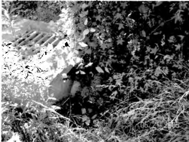
Exterior view of barrel from riser