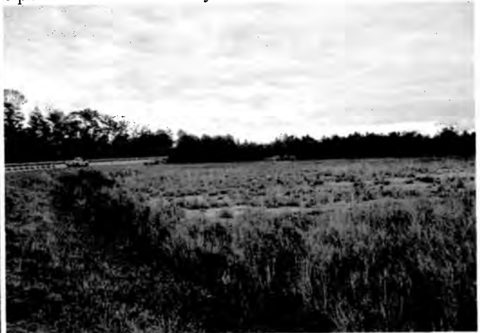
Shallow "Wet" basin with herbaceous vegetation "Dry" Basin with leafy and small woody vegetation