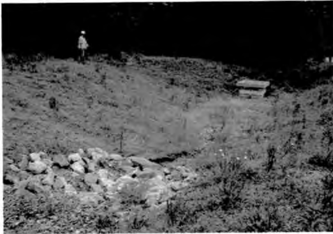
Well maintained and acceptable Basin embankment