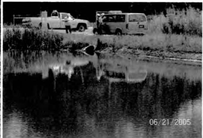
Principal spillway with pipe only, no structure