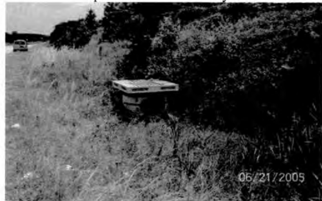
Clear & functional upper stage orifice