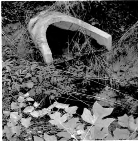
Outlet at downstream embankment w/major erosion