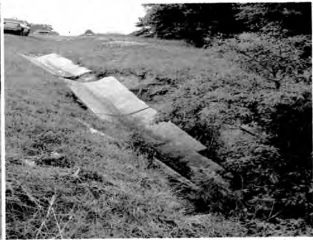
Un-stabilized conveyance channel into Basin inlet