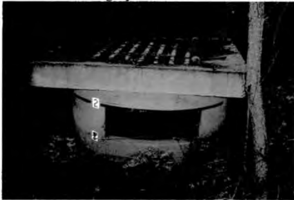
Clear & functional upper stage riser orifice