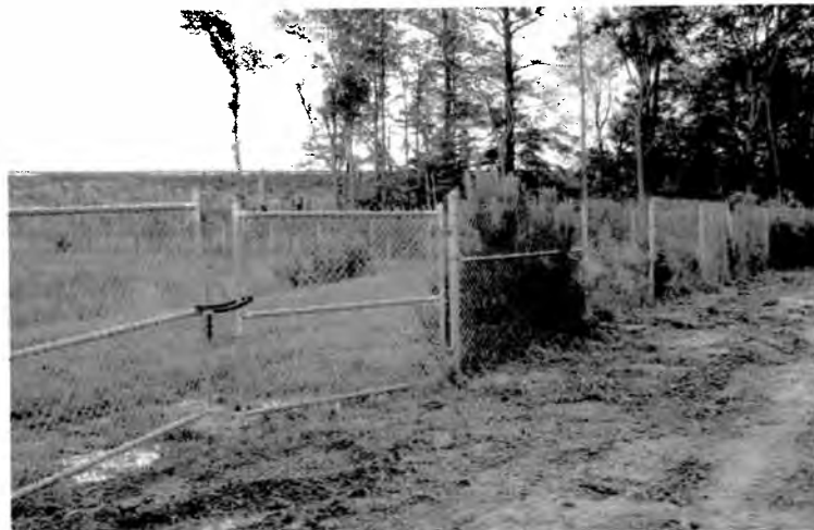
Fence surrounding Basin with gate unsecured and saplings growing in fence line

5 – Fence is not operating as designed. Access to basin can be made easily without using access gate due to vegetation/woody growth compromised fence integrity or other cause. Fence needs entire replacement.