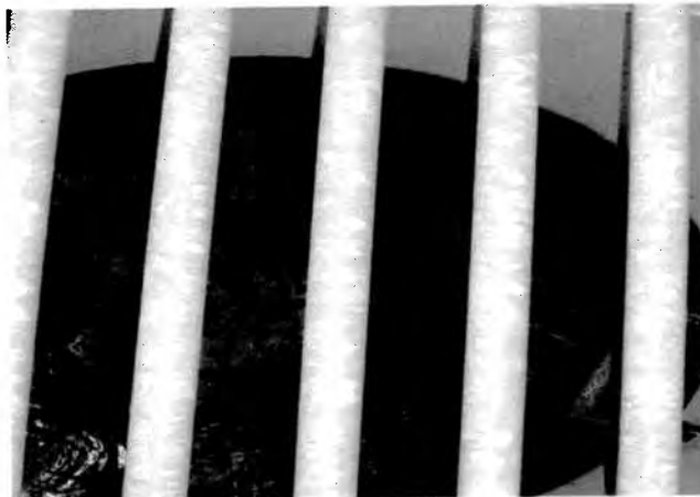
This chamber is leaking water at barrel joint