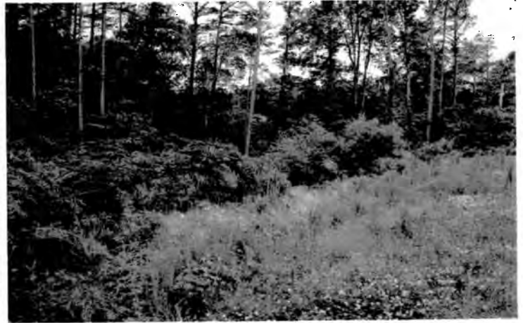
Basin embankment with woody vegetation of 0.5 to 2 inches