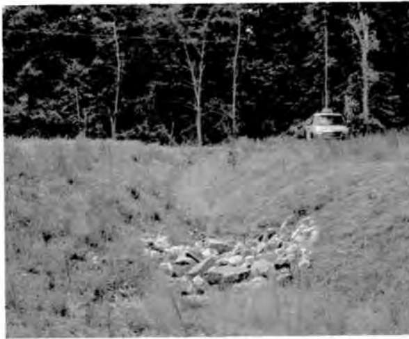
Stabilized conveyance channel into Basin