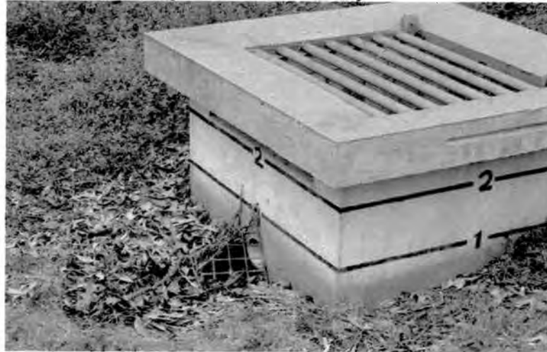
Trash rack clear and functional and structurally sound