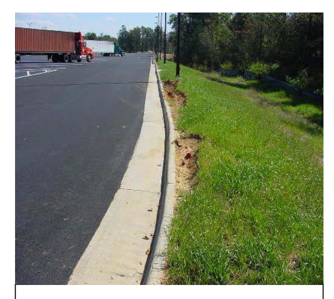
Figure 2-11: Parking Lot Pole Placement outside clear zone

Poles should be placed outside the clear zone for the roadway. <u>TEDM Section V – </u>