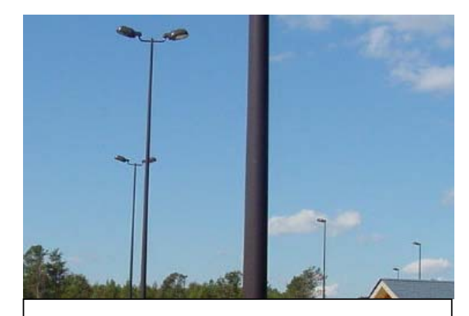
Figure 2-10: Offset lighting with near 0-degree tilt

"Luminaires installed on this project shall have an IESNA optical distribution of Medium-Type IV-Full Cutoff."