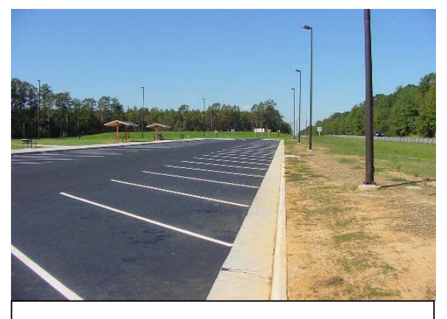
Figure 2-6: Diagonal Markings

After the Preliminary Field Inspection (PFI) Meeting, there should be adequate information in the construction design to review key areas of the plan layout to ensure that the pavement markings can be properly provided.