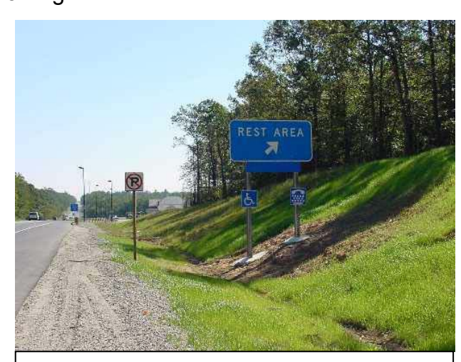
Figure 2-2: Rest Area Guide Signs

Based on the direction provided at the meeting, a preliminary sign design can proceed and should be prepared using the latest design files for the roadway and rest area site.