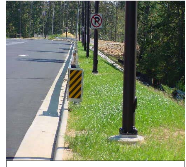
Figure 2-13: Parking Lot Pole Placement behind guardrail

The VDOT Standard CCW-1 Control Center Type C (single-phase voltage) or the Type D (three-phase voltage) provides a photocell for dusk to dawn control of the lights.