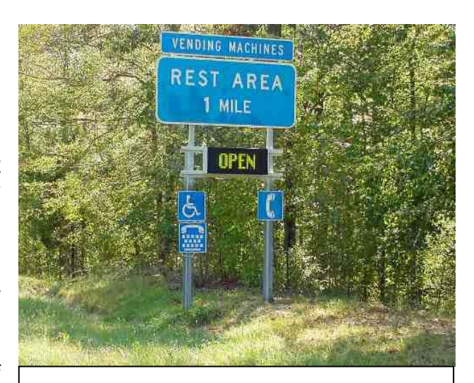
Figure 2-1: Advance Information Guide Sign

In no case should a rest area entrance or exit be placed on or adjacent to speed-change lanes of other access connections. The fatigued driver is less capable of making the necessary maneuvers when approaching decision points. It is equally important to provide positive guidance in