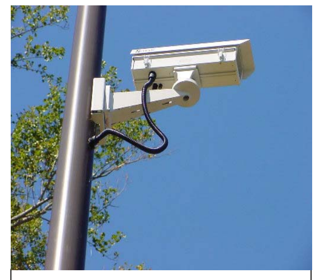
Figure 2-9: CCTV Mounted to Light Pole