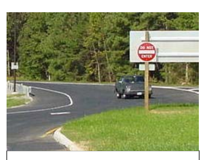
Figure 2-4: Regulatory Signs

Rest areas that generate high use experience problems with improper parking. "No Stopping/Standing" signs