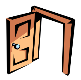
Types of public hearings: Open Forum Hearing Traditional Hearing

VDOT may arrange for local public officials or other responsible persons to conduct a hearing. However, it is the responsibility of VDOT to meet hearing requirements and to provide proper representation.